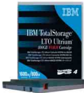
LTO 4 WORM cartridge