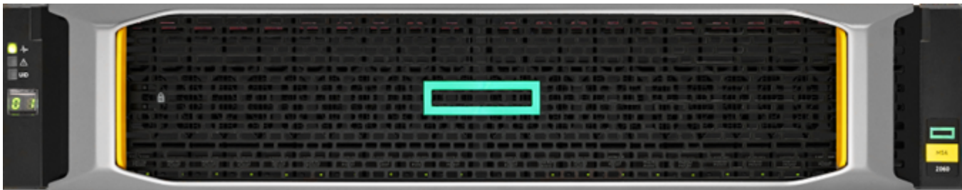
HPE MSA 2060 Storage

The HPE MSA 2060 is a flash-ready hybrid storage system designed to deliver hands-free, affordable application acceleration for small and remote office deployments. Don't let the low cost fool you. It gives you the combination of simplicity, flexibility, and advanced features you may not expect in an entry-priced array. Start small and scale as needed with any combination of solid state drives (SSDs), high-performance Enterprise SAS HDDs, or lower-cost Midline SAS HDDs. With the ability to deliver 325,000 IOPS, the new MSA 2060 is up to 45% faster than its prior generation with ample horsepower for even the most demanding workloads.