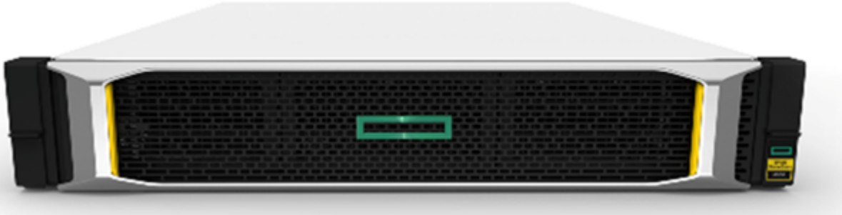
HPE MSA 1050 SAN Storage

The HPE MSA 1050 SAN Storage brings affordable flash storage down to ever lower customer segments. The MSA 1050 is designed to meet entry-level storage requirements and budgetary constraints. With the lowest storage array price points in the HPE Storage portfolio and field-proven ProLiant compatibility, the MSA 1050 is the platform of choice for smaller SAS, iSCSI and FC deployments. The HPE MSA 1050 features 8Gb Fibre Channel, 12 Gb SAS, and 1GbE and 10GbE iSCSI at previously unattainable entry price points.