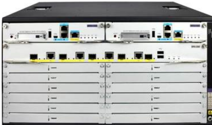
HPE FlexNetwork MSR4080 Router Chassis (SPU-200) - Front View

The MSR4000 series provides an agile, flexible network infrastructure that enables you to quickly adapt to your changing business requirements while delivering integrated concurrent services on a single, easy-to-manage platform.