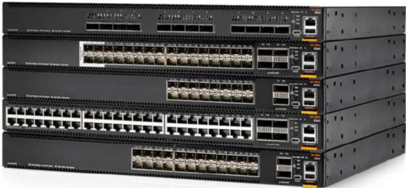
Aruba CX 8360 Switch Series

In addition, the 32 x 25G port 8360 models support lowdensity MACsec ports and enable secured connectivity at 10GbE and 25GbE over unsecured domains.