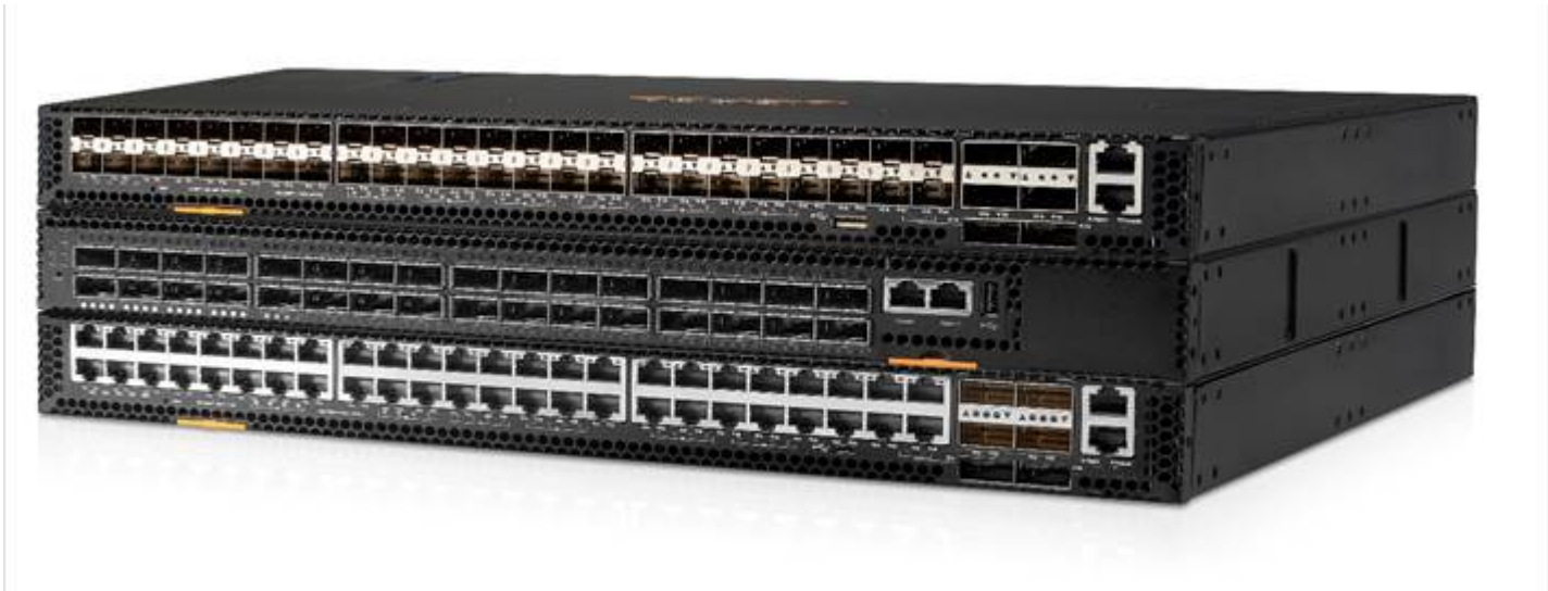
Aruba CX 8320 Switch Series

The CX 8320 provides industry-leading line rate 1/10GbE (SFP/SFP+ and 10GBASE-T) and 40GbE connectivity in a compact 1U form factor. Together with the modular Aruba CX 8400 chassis and the Aruba CX 8325 series,, the CX 8320 rounds out Aruba's switching portfolio with an enterprise core and aggregation solution that ensures higher performance and higher uptime.