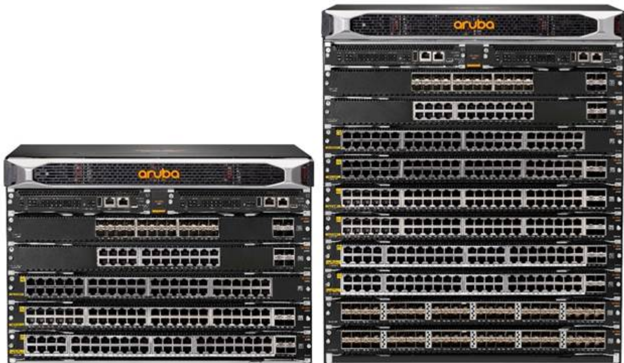
Aruba CX 6400 Switch Series

Aruba Dynamic Segmentation extends Aruba's foundational wireless role-based policy capability to Aruba wired switches. What this means is that the same security, user experience and simplified IT management can be enjoyed throughout the network. Regardless of how users and IoT devices connect, consistent policies are enforced across wired and wireless networks, keeping traffic secure and separate.