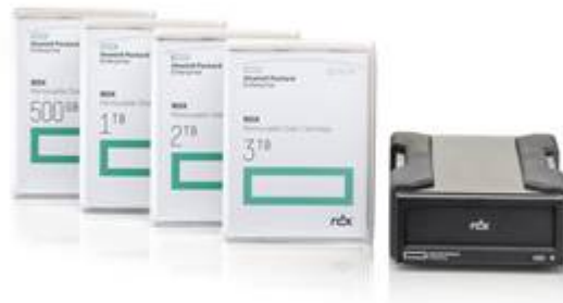
HPE RDX Removable Disk Backup System

HPE RDX Removable Disk Backup System is a disk-based back up and recovery solution with critical security layers, unmatched portability, fast recovery and easy integration into any small business environment. Its also rugged, removable, easy-to-use, and cost effective for remote or branch office locations, small offices or home offices with little or no IT resources. HPE RDX works exceptionally well in harsh work environments where businesses need to protect, manage, transport or capture large amounts of data in less than ideal locations.