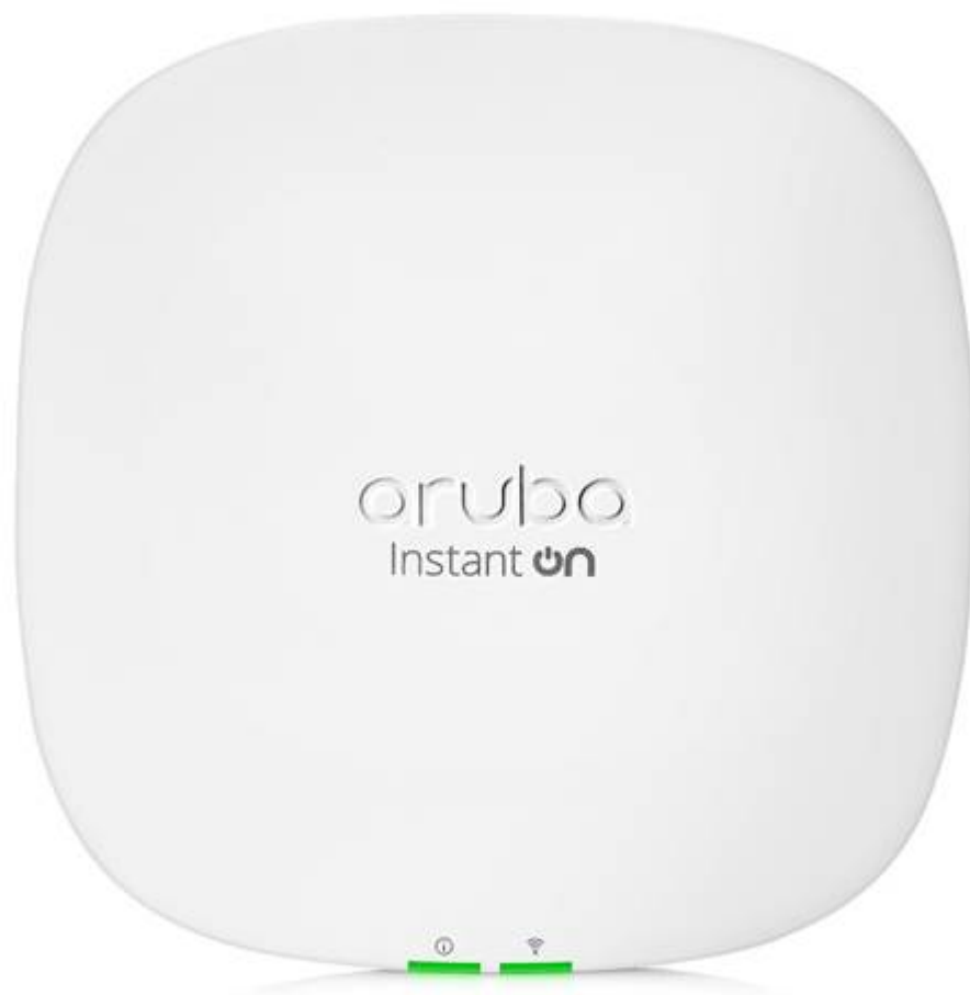
Aruba Instant On AP25 Indoor Access Points