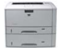
HP LaserJet 5200dtn printer